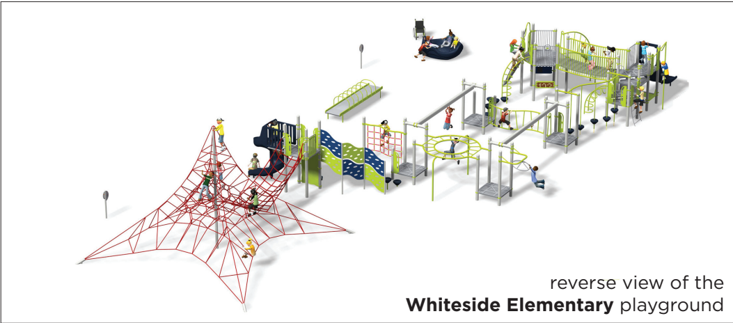
reverse view of the Whiteside Elementary playground

What was the average amount raised per booklet? The average amount raised per student was $33.