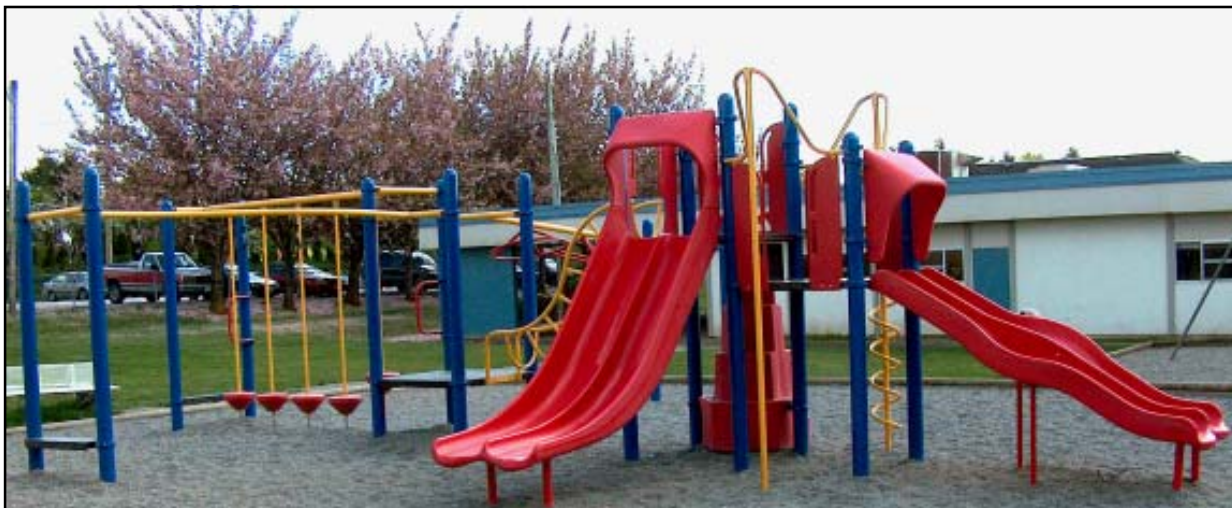
✓ Bradner Elementary • 5291 Bradner Road • Abbotsford, BC

Call us now @ toll free 1 (866) 422-4828 to arrange a complimentary playground site visit with Mark Bodie Owner of Habitat & Canadian Certified Playground Inspector