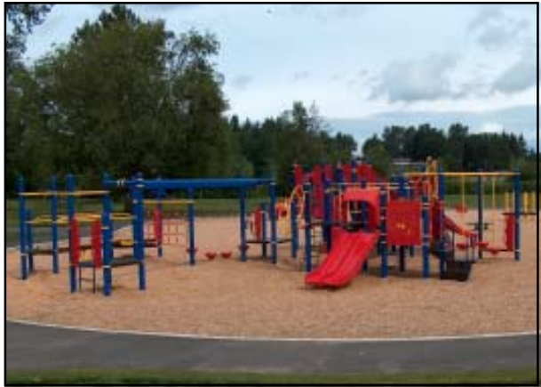
✓ Mill Lake Park • Near the corner of Bevan Ave. and Gladwin Rd. • Abbotsford, BC

Habitat Systems Inc. is a distributor of outdoor park and recreation products in Western Canada. Since Habitat's opening in 1996, we have made it our goal to provide a product portfolio that best meets the needs of our clients. We select innovative products that meet strict quality and safety standards and offer a first-rate service that has established us as a preferred supplier in school districts, municipalities and landscape architecture firms. Our services include complimentary site assessments, custom designs, product recommendations and installations. At Habitat we strive to provide our clients with products which create safe environments where children and adults have the opportunity to create, imagine, dream and learn together. ✓