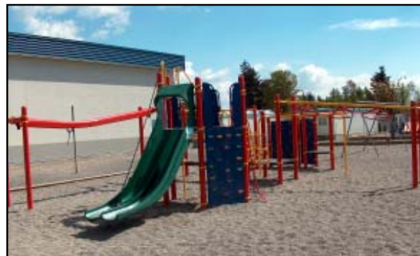
✓ King Traditional Elementary • 28776 King Road • Abbotsford, BC