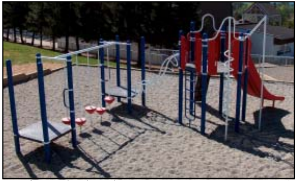
✓ Prince Charles Elementary • 35410 McKee Road • Abbotsford, BC