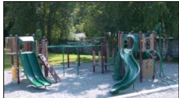
✓ David Brankin Elementary, Surrey, BC