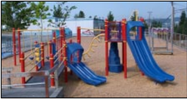
✓ James Ardiel Elementary, Surrey, BC