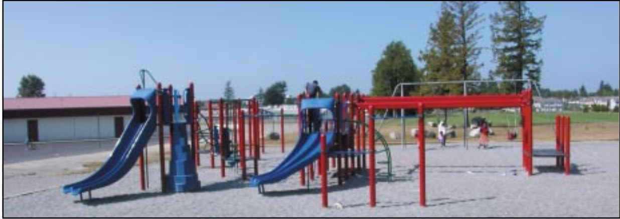
✓ Strawberry Hill Elementary, Surrey, BC