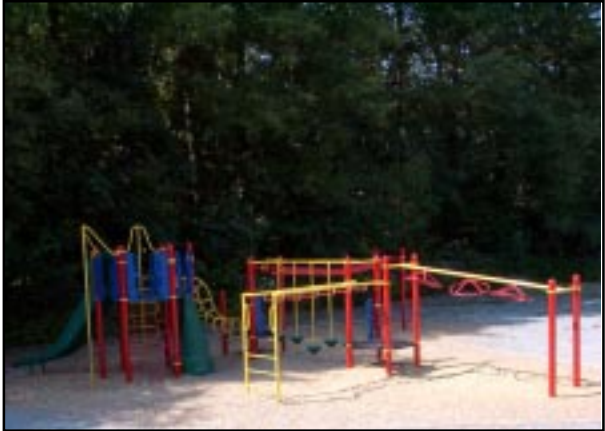
✓ Bear Creek Elementary, Surrey, BC

Call us now @ (604) 294-4224 to arrange a complimentary site visit with a Habitat Canadian Certified Playground Inspector