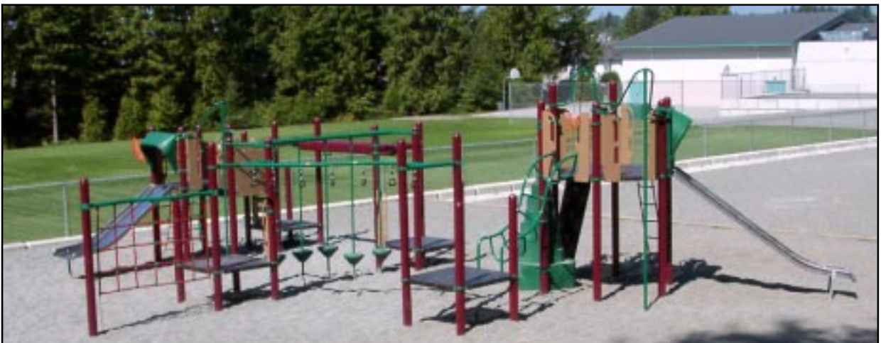
✓ Boundary Park Elementary, Surrey, BC