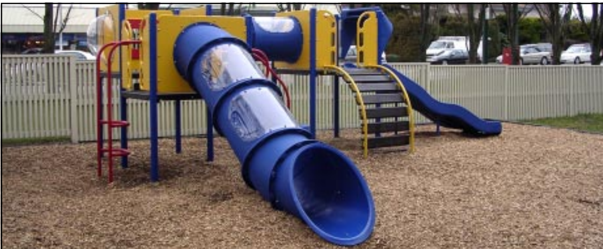
✓ Vancouver Bilingual Preschool • 949 West 49th Ave. New Westminster, BC