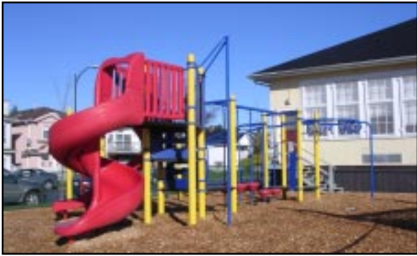
✓ McBride Elementary • 1300 29th Ave East, Vancouver