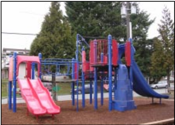
✓ Laura Secord Elementary • 2500 Lakewood Drive, Vancouver

Habitat Systems Inc. is a distributor of outdoor park and recreation products in Western Canada. Since Habitat's opening in 1996, we have made it our goal to provide a product portfolio that best meets the needs of our clients. We select innovative products that meet strict quality and safety standards and offer a first-rate service that has established us as a preferred supplier in school districts, municipalities and landscape architecture firms. Our services include complimentary site assessments, custom designs, product recommendations and installations. At Habitat we strive to provide our clients with products which create safe environments where children and adults have the opportunity to create, imagine, dream and learn together. ✓