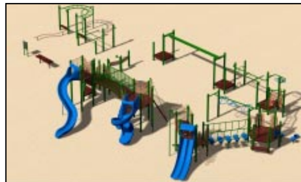
✓ Lord Kitchener Elementary 3D • Vancouver, BC

The Landscape Structures playground equipment selected by Kitchener was chosen based on a variety of factors including environmental concerns, warranty, company history, references, the opinion