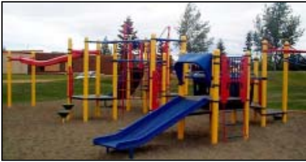
✓ Leduc Estates • Edmonton, AB