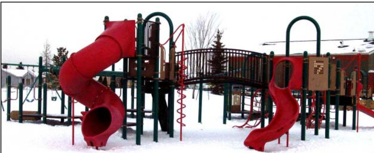
✓ Tipaskan • Edmonton, AB

Please contact Habitat Systems for a complete playground installation list.