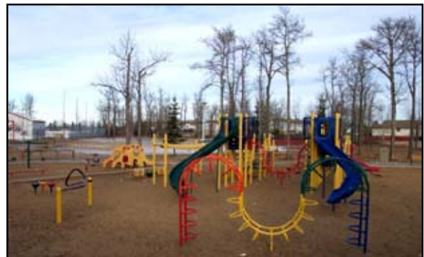
✓ Crawford Plains • Edmonton, AB