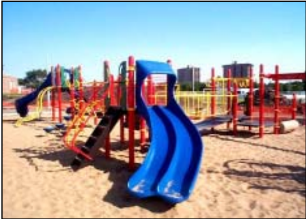
✓ McKee Elementary • Edmonton, AB