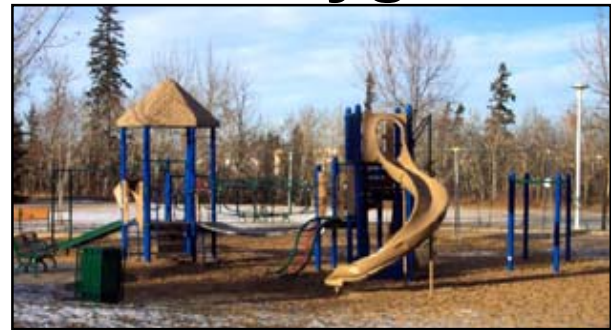
✓ Sheriff Robertson Park • Edmonton, AB