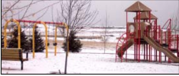
✓ Panorama Park • Calgary, AB