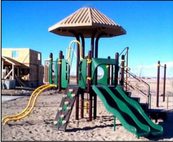
✓ Cougar Ridge • Calgary, AB