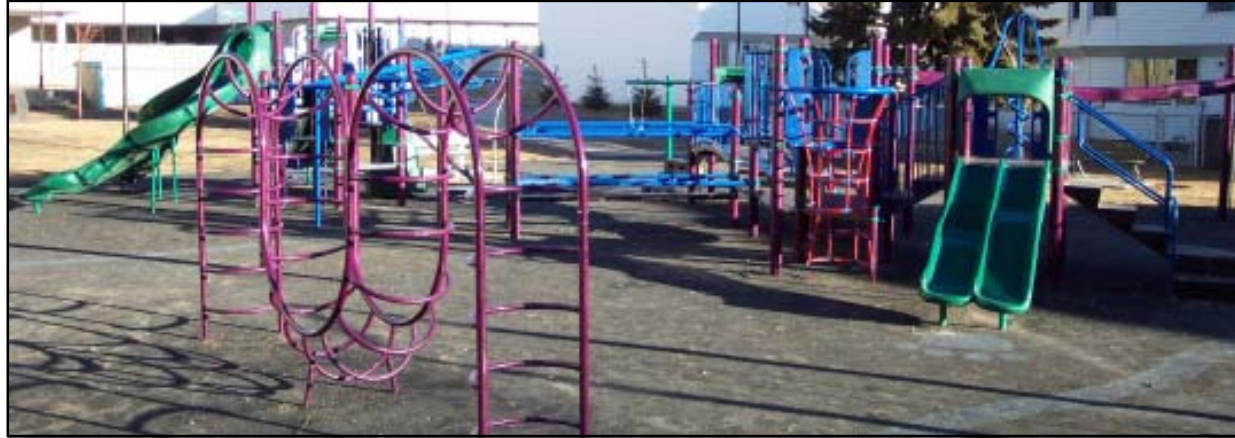
✓ For the Love of Children Society, Shaganappi Community Association • Calgary, AB