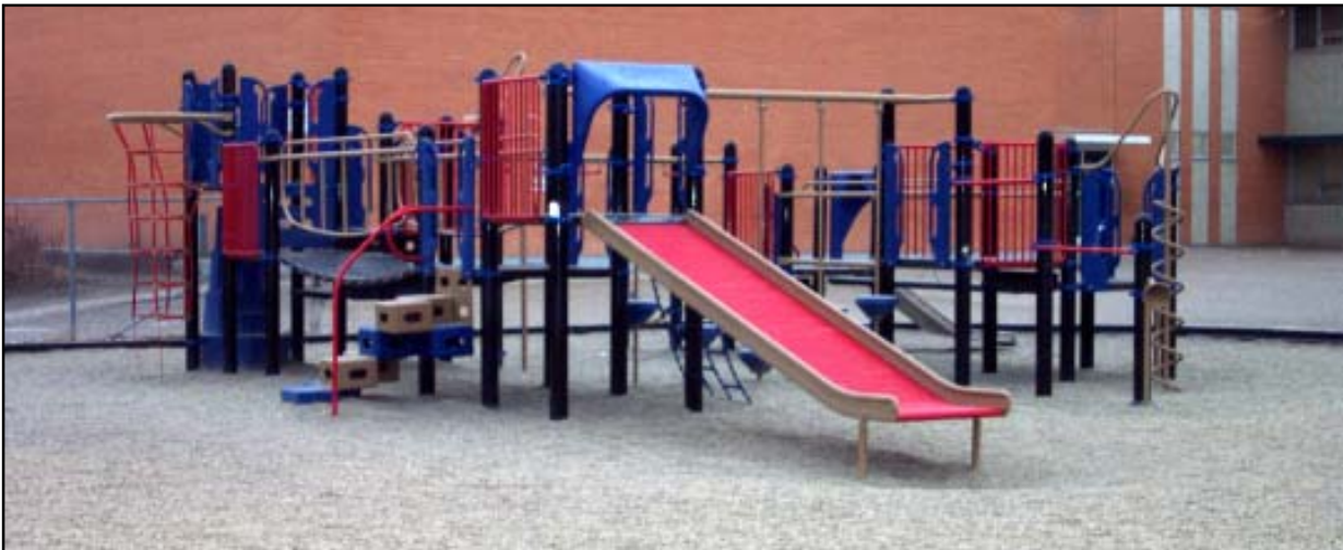
✓ Brentwood Elementary • Calgary, AB