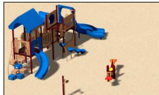
✓ Memorial Park Toddler Area 3D • Delta, BC

Delta received a total of 5 proposals in response to the RFP. These proposals were evaluated based on a variety of items which included previous playground experience, CSA approved components, quality