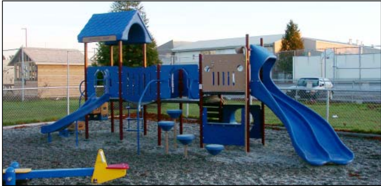
✓ Memorial Park • Delta, BC