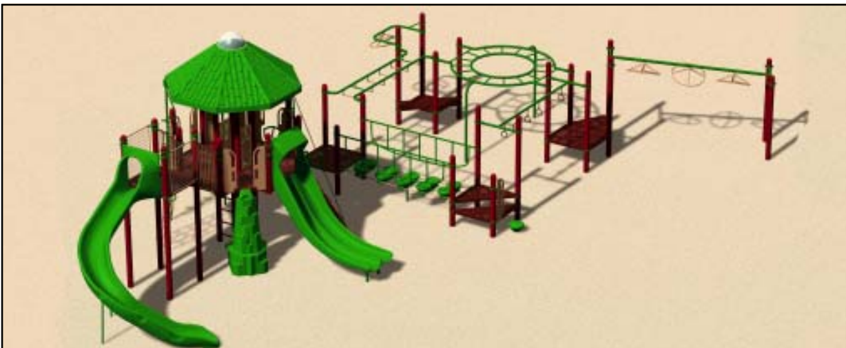
✓ Herbert Spencer Elementary School • New Westminster, BC