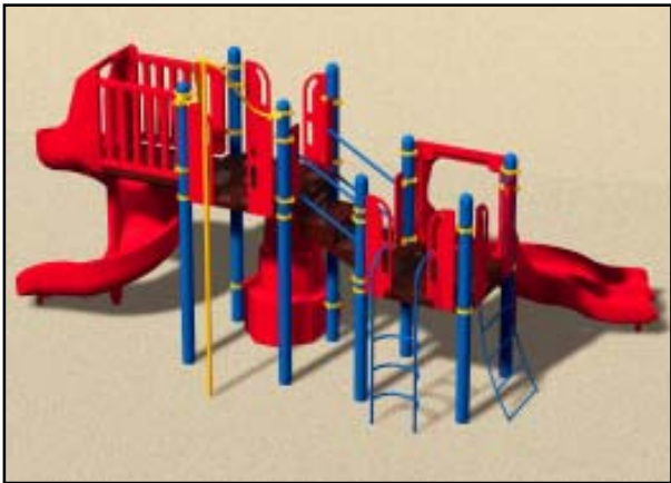
✓ Heather-Dolphin Park • Richmond, BC

Habitat Systems Inc. is a distributor of outdoor recreation products in British Columbia, Alberta, Yukon, Northwest Territories and Nunavut. Habitat is entering its 8 th year of operation and in that time has established itself as a preferred playground supplier in many school districts, municipal offices and landscape architecture firms. Habitat Systems Inc. strives to provide safe play environments where children have the opportunity to create, imagine, dream and learn together. ✓